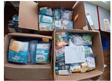
51 Women's Hygiene Kits Ready to go to U.M.C.O.R for disaster relief

We also reached out further by collecting feminine hygiene supplies and donations which enabled us to pack 51 feminine hygiene kits for UMCOR (United Methodist Committee on Relief) at a total value of $700.