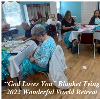
"God Loves You" Blanket Tying 2022 Wonderful World Retreat

I believe that through our revived monthly brunch meetings we were not only able to renew but also to encourage new connections and relationships with other women in our church. We were engaged in Wednesday Night Bible Study; a Stay-Retreat; Fellowship Events; Devotion; Prayer; Planning; and, Service Projects. We served our local church with random acts of kindness throughout the year to unsuspecting church members through flowers, meals, greeting cards; and, birthday cakes delivered by a group of ladies (H.U.G.S. Squad*); by raising funds for the Women's Ministry through the craft and bake sale from which we were able to donate $1000 to the Building Fund; by decorating (and un-decorating) the church for the advent season; and, by serving as hostesses at funeral receptions as well as other church fellowship functions. We served women in the community by donating to Whispering Hope 12 baby tie-blankets that were tied as part of our Fall Retreat.